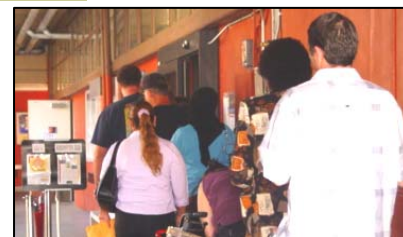
Students line up outside the Financial Aid and EOPS offices in the A-building patio.