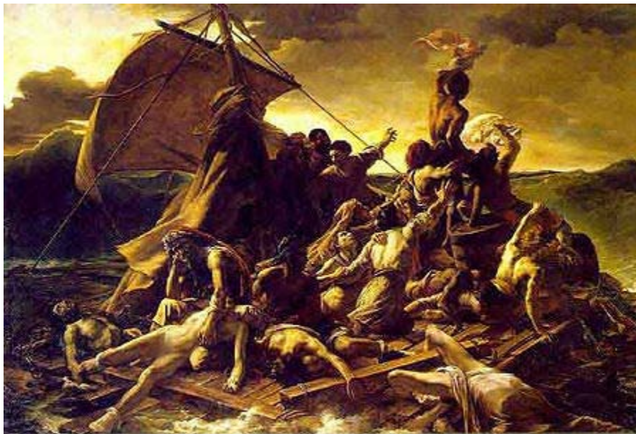
Théodore Géricault: Raft of the Medusa (Louvre Museum, Paris)

In June 1816, a small convoy of French ships set out on a voyage to Senegal, with the ship "Medusa" in the lead. Unfortunately, due to improper navigation by a poorly trained captain, the Medusa hit a sandbank off the coast of Mauritania. While the other ships sailed ahead, frantic efforts were made to free the Medusa, but these efforts were in vain. The ship continued to sink. Those who could be accommodated in life boats set off to safety. However, many were abandoned on the