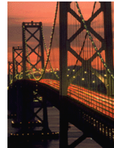
Bridging the gap between you and your education goals