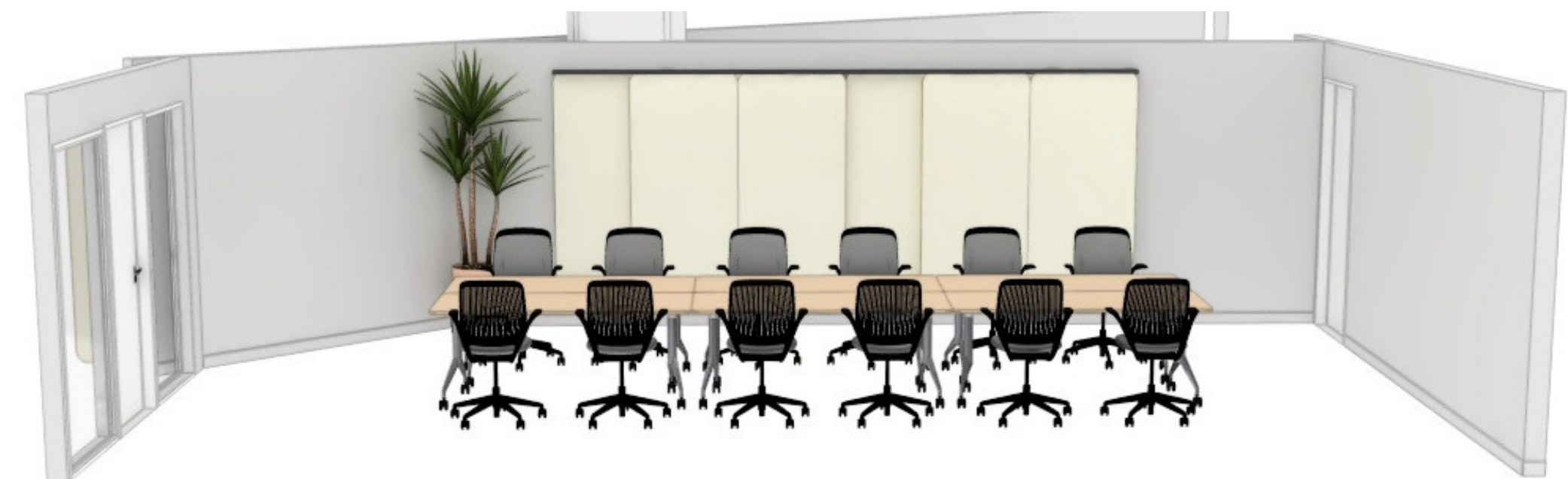
BREAKOUT PROFESSIONAL-WORKSHOP & TRAININGS 5