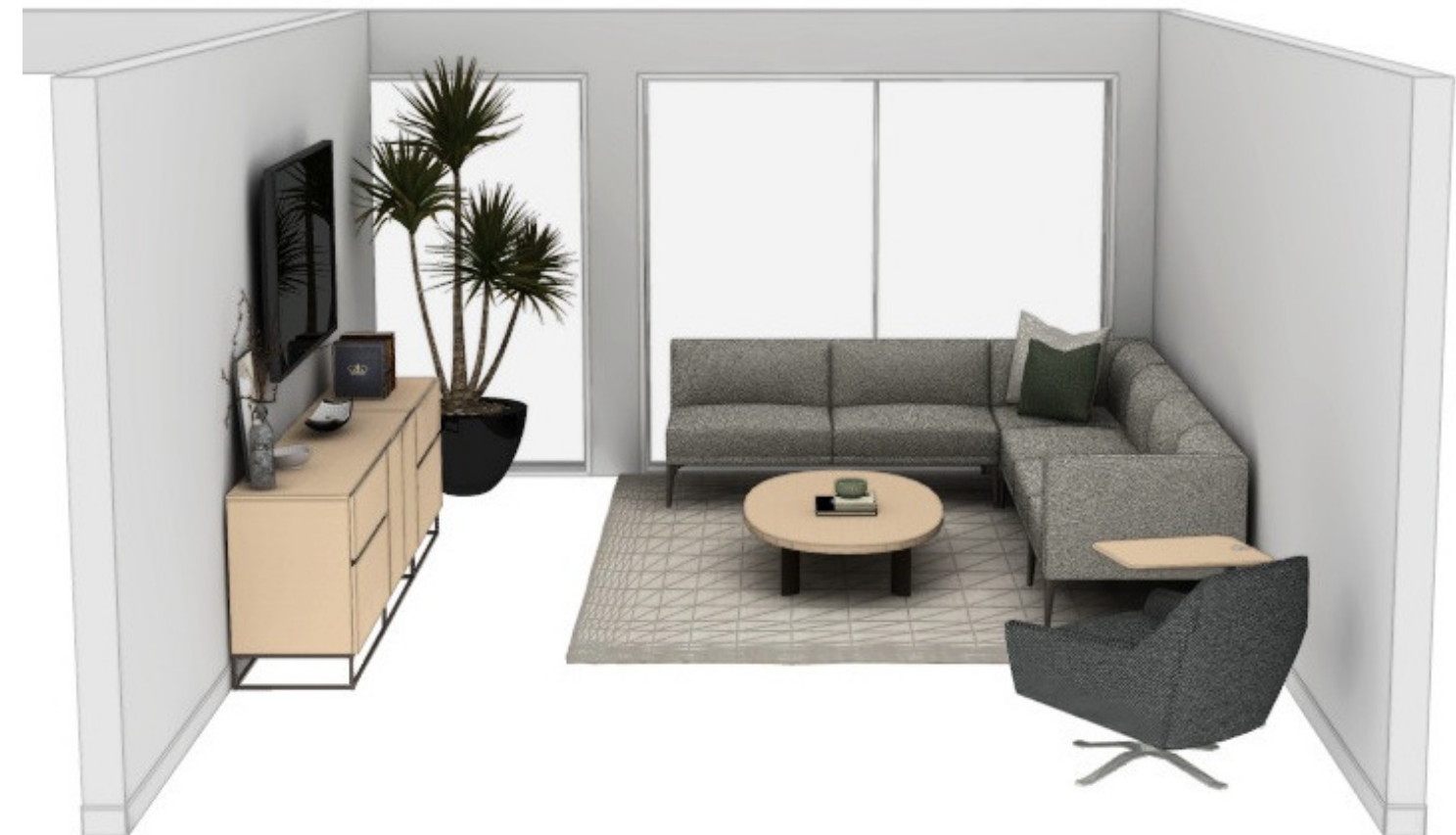
WAITING ROOM 17