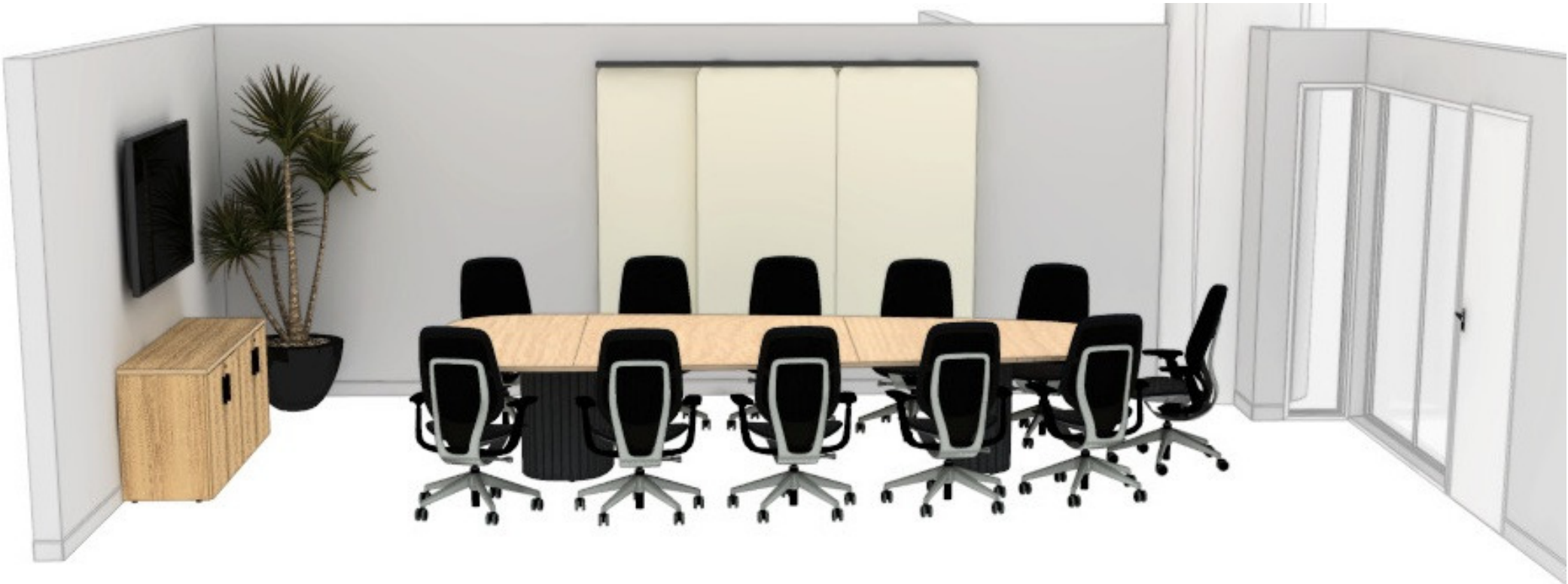
CONFERENCE ROOM 11