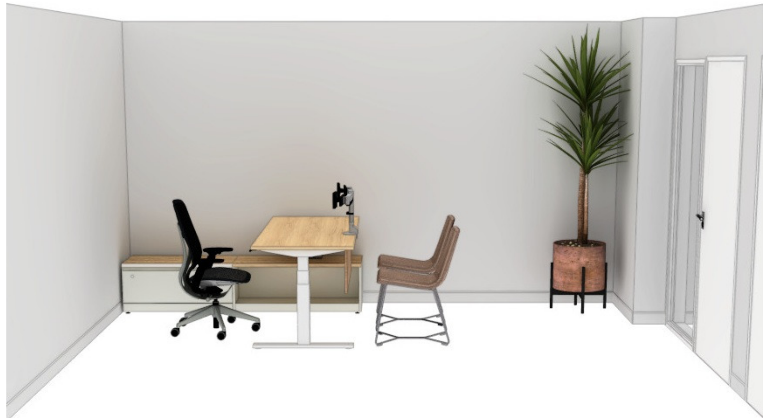
PRIVATE OFFICE (OPTION 2)