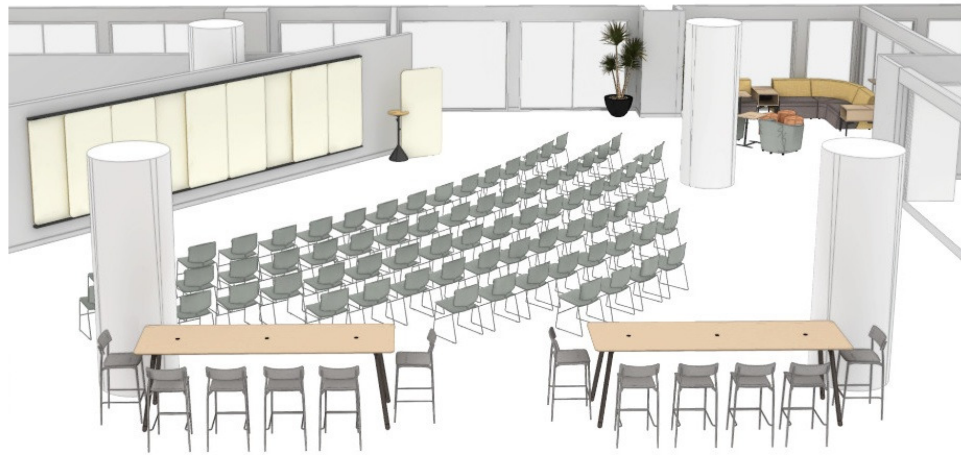
OPEN SEMINAR SPACE 4