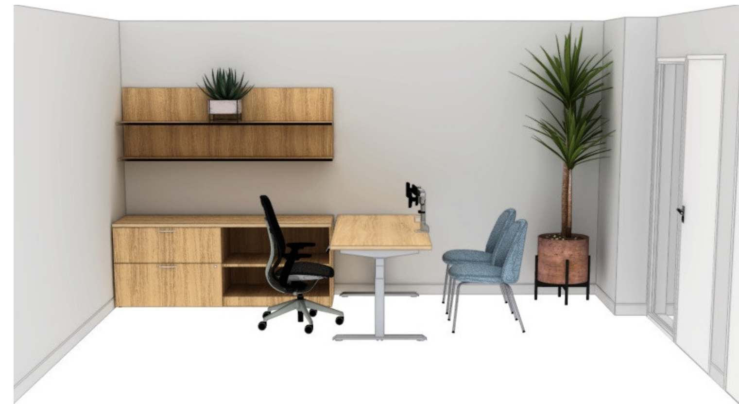
PRIVATE OFFICE (OPTION 3)