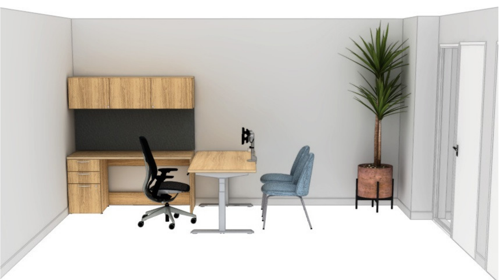
PRIVATE OFFICE (OPTION 1)