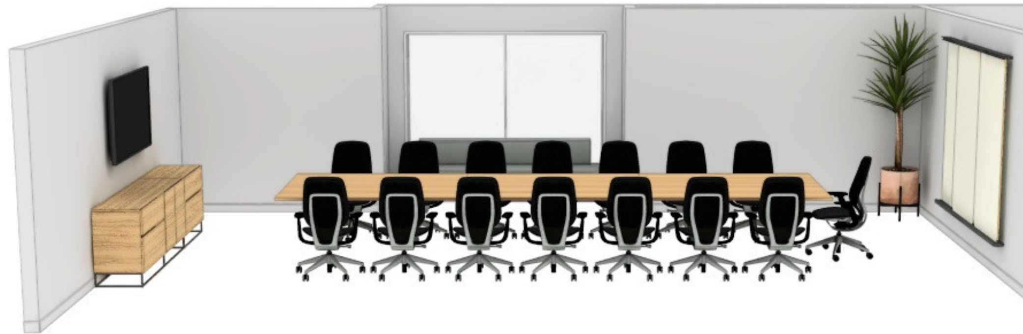
CONFERENCE ROOM 19